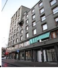
2. The National Museum of Art, The Library, Kristian Augusts gate 23