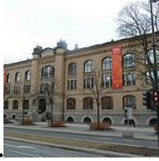
1. Museum of Cultural History, Frederiks gate 2