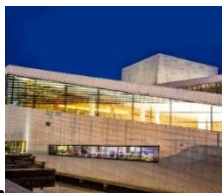
6. The Opera House, Kirsten Flagstads Plass 1