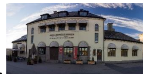
5. The National Museum of Art, Mellomstasjonen, Brynjulf Bulls Plass 2