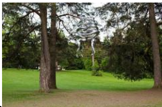
7. Ekeberg Sculpture Park, Kongsveien 15