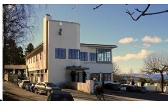
8. Ekebergrestauranten, Kongsveien 15