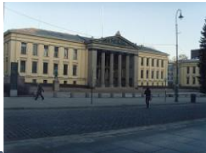
4. University of Oslo, Aulaen, Karl Johans gate 47