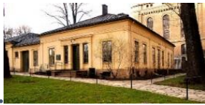
3. University of Oslo, Professorboligen, Karl Johans gate 47